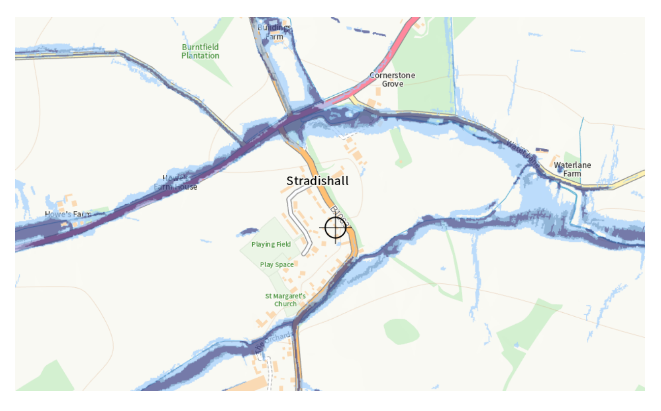
Extent of flooding from surface water